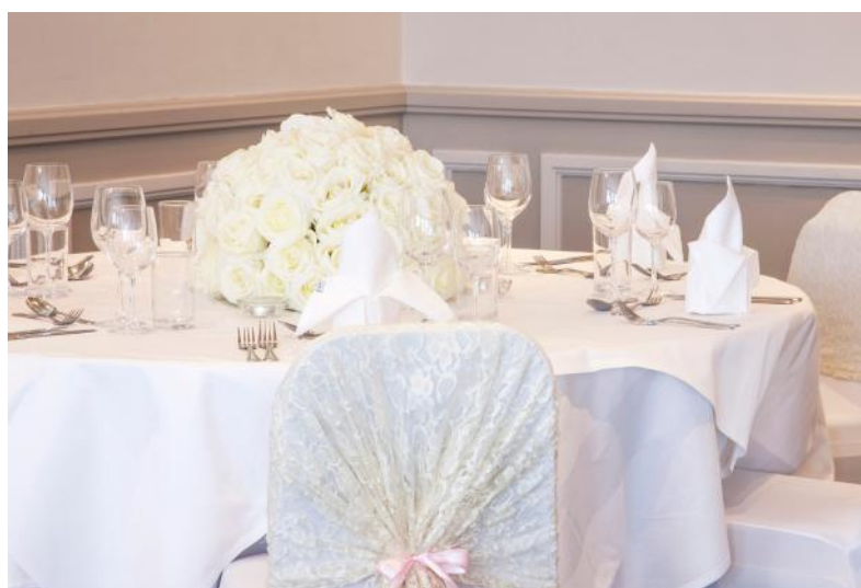
Top; photography courtesy of Dan Wilkinson Photography